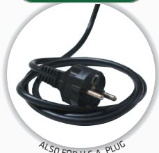
ALSO FOR U.S.A. PLUG