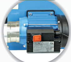
CMP AC 35